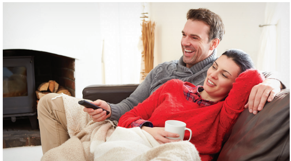
Cornerstone Group © 2019

We appreciate your support of us as your local cable TV provider and promise to keep fighting on your behalf. After all, our customers are also our friends and neighbors. If you have questions or would like more information about our TV services, call (641) 332-2000.